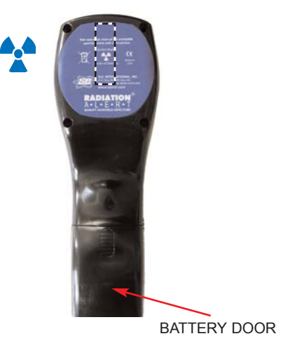
Illustration 2 MONITOR 4, 4EC, MC1K